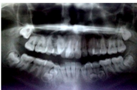
[Table/Fig-2]: Orthopantomograph of the patient taken at 14 years showing supernumerary teeth in mandible and maxilla