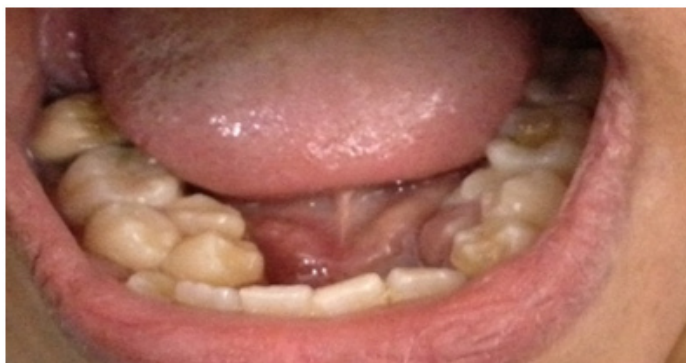
[Table/Fig-1]: Intra oral picture showing the lower supplemental teeth and cluster formation at the age of 24 years

report any similar familial history. Patient told that due to various dental problems over the years regular orthopantomographs were taken at different ages [OPG at the age of 14 [Table/Fig-2] and 17 years [Table/Fig-3]]. A new OPG was also taken when the patient first reported to the clinic. On careful examination of all the OPGs {only the latest one being digital at 24 years of age, [Table/Fig-4]}, it was concluded that there was dental lamina formation around the premolar region of maxilla and mandible, which later developed into premolars. These supplemental teeth could not be identified as odontomas as they have shape, structure and tissue differentiation similar to premolars and much resemblance that it was difficult to differentiate between actual premolars and the supplemental ones, on clinical and radiographic examination. Occlusal radiographs revealed that these teeth were not fused, but were separate supplementary teeth. In case of maxilla the supplemental premolars were found to be impacted and were present close to the sinus lining. No association with cyst or any other lesion was found thus maxillary supplemental premolars were decided to be left in situ for the time being, with regular radiographic and clinical follow-up. For mandibular supernumerary teeth removal was planned with patient's approval. No new tooth buds were noted anywhere in maxilla or mandible. Regular follow up every year was advocated to see any further changes in the dentition.