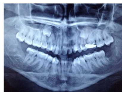
[Table/Fig-4]: OPG of the patient taken at 24 years showing tooth buds in maxilla and supernumerary teeth both in maxilla and mandible